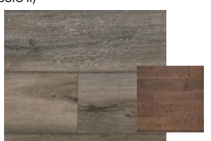
BRUCE LIFESEAL ROSSEAU GREY HAZE (A - SPC)