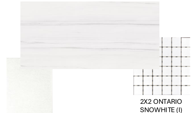
MANCHESTER MDF WHITE (CLASSIC II)