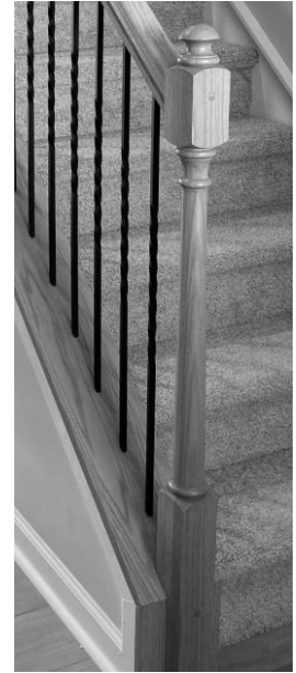
Spindles & Newell Post per plan Stair Railings