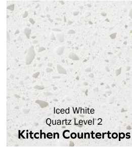
Iced White Quartz Level 2 Kitchen Countertops