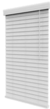
2" Faux Wood Blinds Window Coverings