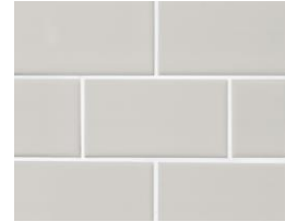
Baker Blvd Warm Grey 3x6 Level 2 Subway Tile Backsplash