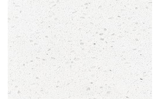
Frost White 1.5 CM Base Level Quartz Bath Countertops