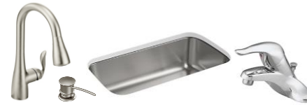
Arbor Stainless Steel Faucet, Single Bowl Undermount Stainless Steel Sink, and Chateau Chrome Fixtures Kitchen & Bath Plumbing