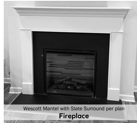
Wescott Mantel with Slate Surround per plan Fireplace

Due to supply constraints, appliances may be substituted with another appliance of equal or greater value. Please note manufacturers change model numbers frequently and without notice. Different monitor calibrations may display variations in color. Visit builder community to view materials installed for better color representation. Availability, features and specifications are subject to change without notice. Revised 12.5.24