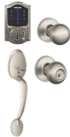
Barcelona Nickel Door Hardware