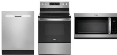
Whirlpool Electric Level 2 Appliances