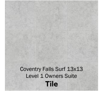
Coventry Falls Surf 13x13 Level 1 Owners Suite Tile