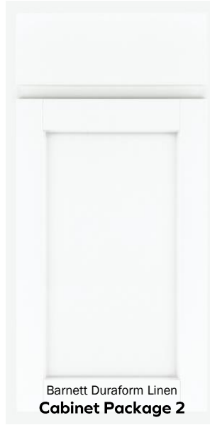
Barnett Duraform Linen Cabinet Package 2