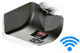
Genie Wi-Fi Connected Pro Series Garage Door Opener with Remotes