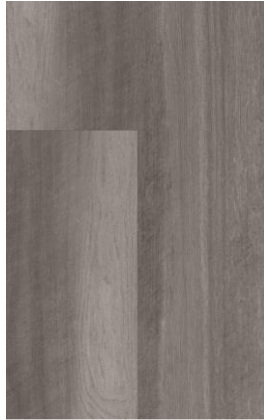
Bishop Shores Oyster Oak Level 1 Foyer, Gathering, Kitchen, Breakfast, Mudroom, Secondary Bathrooms and Laundry room per plan Vinyl Plank Flooring